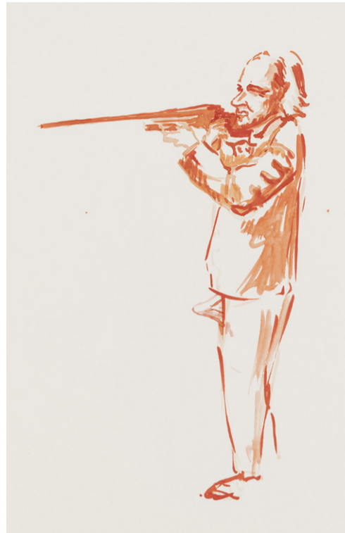
2018 Erwin Wurm, Kunstmuseum Luzern, Albertina Vienna, Verlag für moderne Kunst

O.T. You represented Austria at Venice Biennale in 2017. What interesting projects did you have after that and what exhibitions you are planning to have the next year?