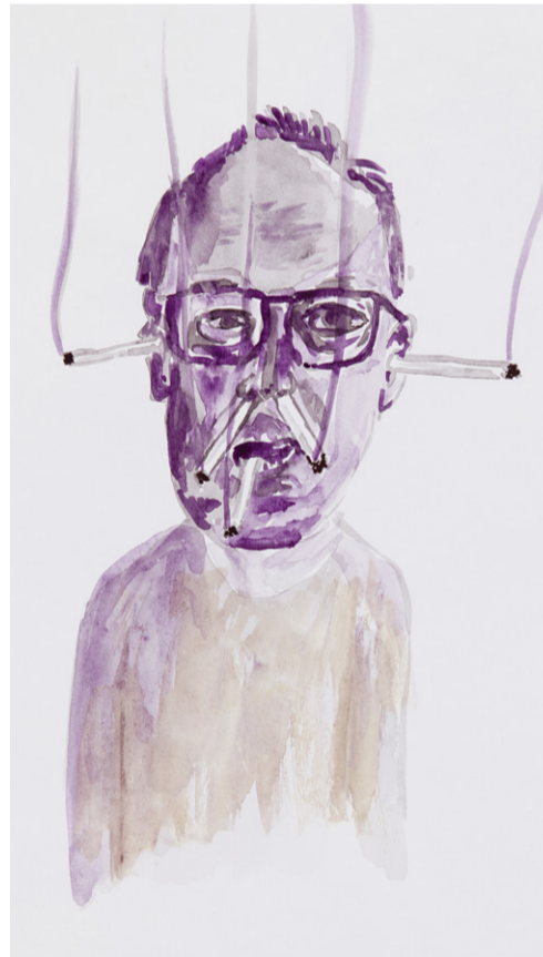
2018 Erwin Wurm, Kunstmuseum Luzern, Albertina Vienna, Verlag für moderne Kunst

E.W. I had several museum shows this year: Storage Hyundai Card in Seoul in collaboration with the Tate Modern where 50 pieces of mine were shown. They also wanted to show the piece from the Biennale; Hot Dog Bus, organized by Public Art Fund New York, which was a big success, they handed over 50.000 hot dogs to the visitors for free at Brooklyn Bridge Park and we already sold the Bus to a Chinese collector, and it will be shown in China as well; then