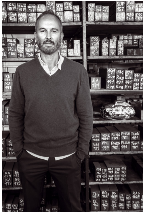
Erwin Wurm @ Inge Prader

Erwin Wurm is one of the most famous contemporary Austrian artists, who represented Austria at Venice Biennale in 2017. His art works are in the best museum collections such as the Centre Pompidou, France; Guggenheim Museum, NY; Gemeentemuseum, Den Haag; Kunsthau, Zurich; National Museum of Art, Osaka; Tate Modern, London; National Gallery of Victoria, Melbourne; Museum Ludwig, Cologne; Städel Museum, Frankfurt; Len-