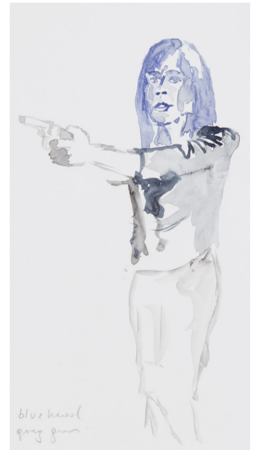
2018 Erwin Wurm, Kunstmuseum Luzern, Albertina Vienna, Verlag für moderne Kunst

E.W. They have to fight, they have to be constant, they have to have a strong will. Of course, it's important to have a talent, but they also have to be strong not to give up if somebody didn't accept their work. At the beginning I wasn't very sure about myself. It was not so easy as I didn't know how my work would develop, but you have to go on, you have to learn from criticism and use it in a positive way. But actually I am still fighting. I believe that the work has to develop and for that reason I try to open new ways and bring new ideas forward. Some artists make copies of their work. This was never a solution for me.